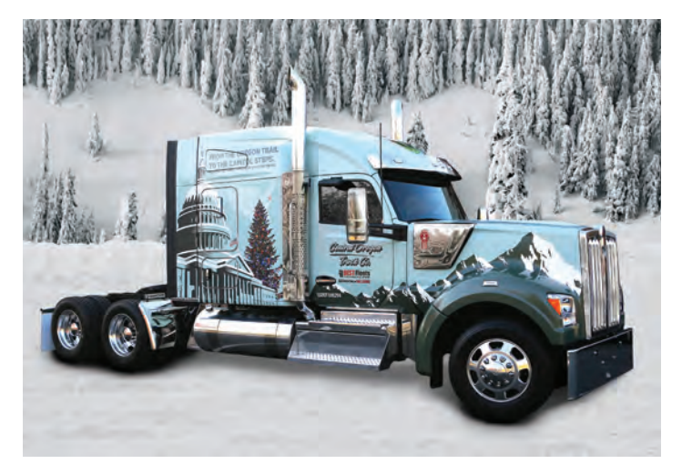
The new Kenworth W990 will transport the 2018 U.S. Capitol Christmas Tree from Oregon's Willamette Forest to Washington, D.C. The W990 is equipped with a 76-inch-mid-roof sleeper and the proprietary powertrain of PACCAR's MX-13 engine, 12-speed automated transmission, and 40K tandem rear axle. Central Oregon Truck Company in Redmond, Ore., was selected as this year's tour hauler. In commemoration of the Oregon Trail's 175th anniversary, the route will follow a reverse path of the famed trail.