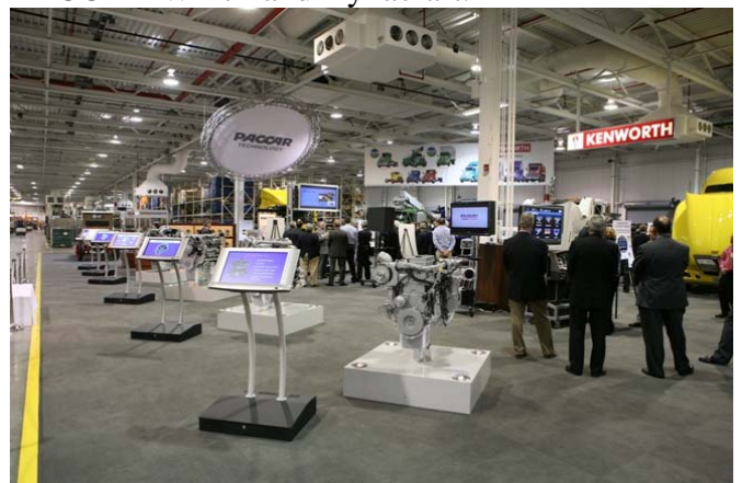
The new PACCAR Technology Center is featured at the award-winning Kenworth plant in Chillicothe, Ohio.

This year, the plant also introduced the new PACCAR Technology Center, which provides visitors with unique insight into PACCAR's technology and quality leadership along with Kenworth's truck products and support services. The PACCAR Technology Center also features PACCAR engines, technology demonstrations and interactive displays, and information from PACCAR Financial, PacLease, PACCAR Parts, PACCAR Winch and Dynacraft.